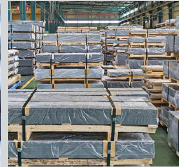
H.R. / C.R. / G.P. PACKETS