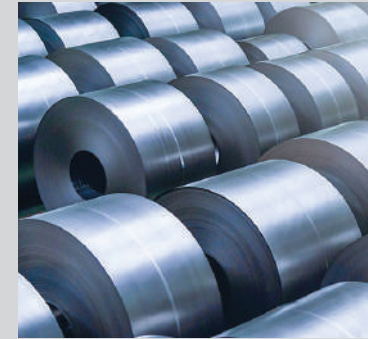
H.R. / HRPO / C.R. COILS