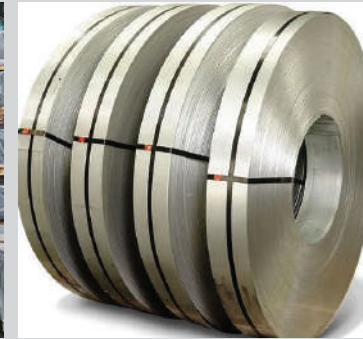
CR / GP SLITTING COILS